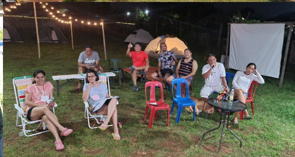
KARAOKE TIME AFTER MOVIE TIME OF THE KIDS