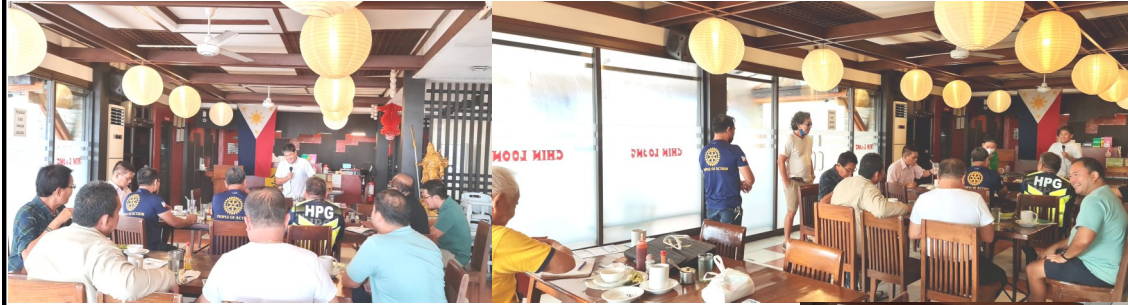
Intense discussion on Rotary matters and upcoming events